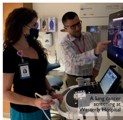
A lung cancer screening at Westerly Hospital

Through its Lung Cancer Screening Program, the Smilow Cancer Hospital at Westerly aims to impact the number of new cases. The program includes a comprehensive multidisciplinary team of internationally recognized pulmonologists, chest radiologists, thoracic surgeons, thoracic oncologists, tobacco treatment specialists and nurse practitioners. The goal is to provide