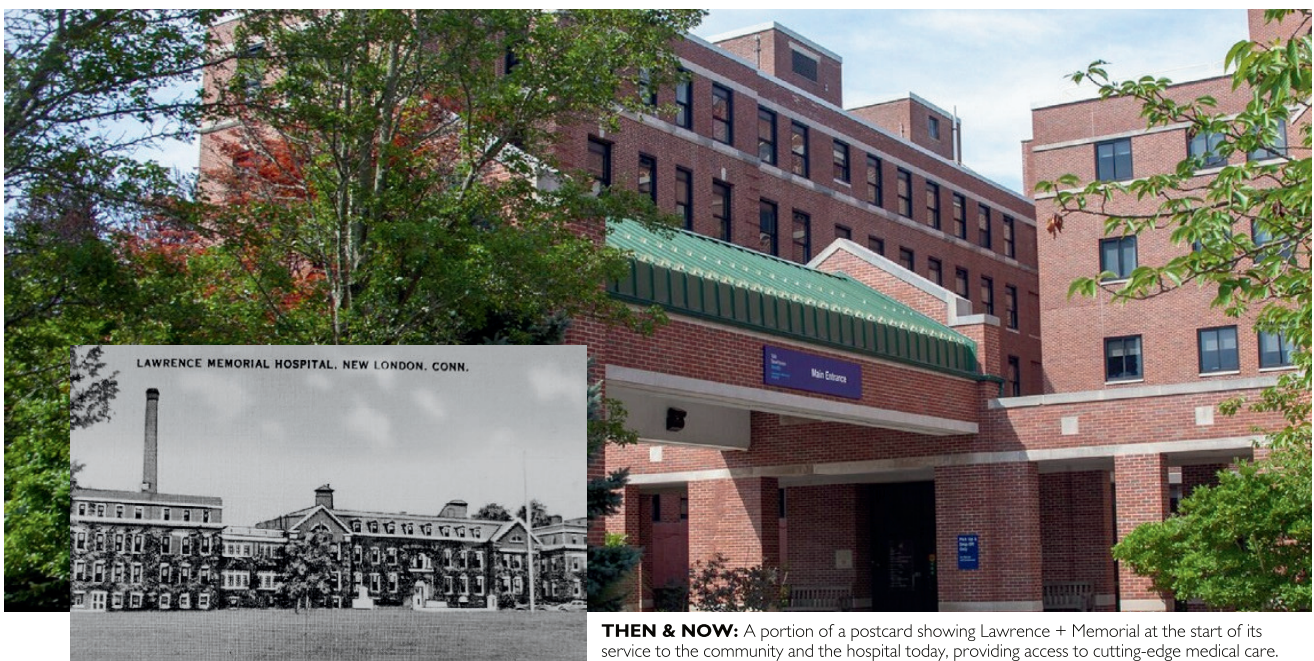
THEN & NOW: A portion of a postcard showing Lawrence + Memorial at the start of its service to the community and the hospital today, providing access to cutting-edge medical care.